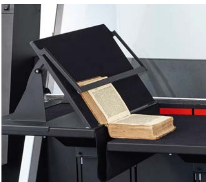
■ Bookholder on Copyboard OT 180 H 35 XL