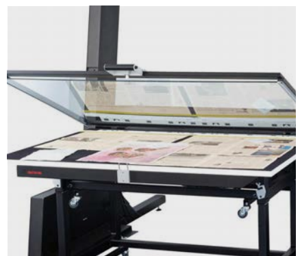
■ Toplight Table AT 0 with opened glass plate