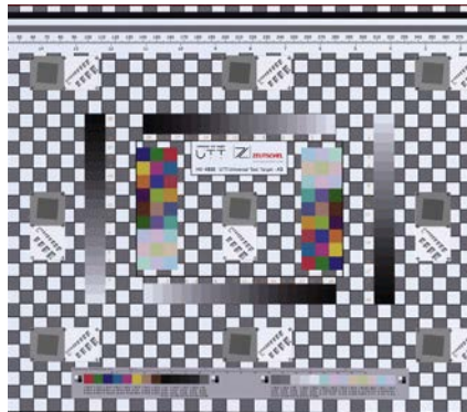
■ fulfills ISO 1964 / Quality Level A, Full Metamorfoze and FADGI****