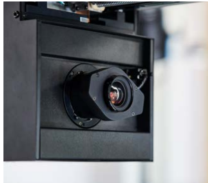
■ Camera system based on a CMOS sensor with optional optical zoom