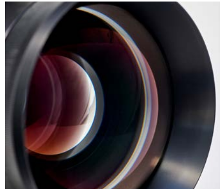
■ Perfect interplay between high-quality technical components