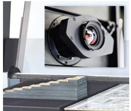
■ high depth of focus - electronic shutter