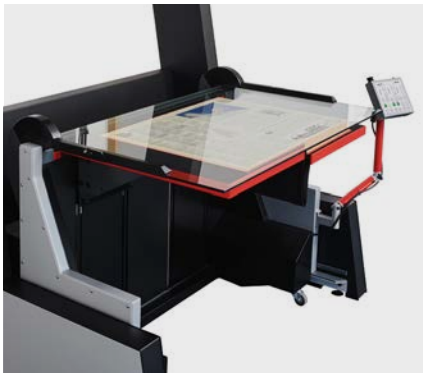
■ wide range of interchangeable copyboard systems