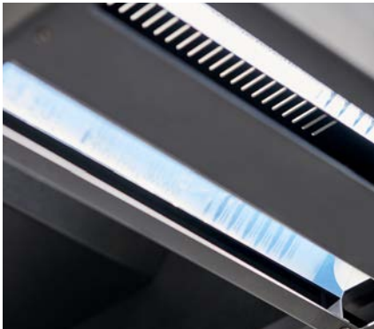
■ LED lighting system for reflection-free and shadow-free results